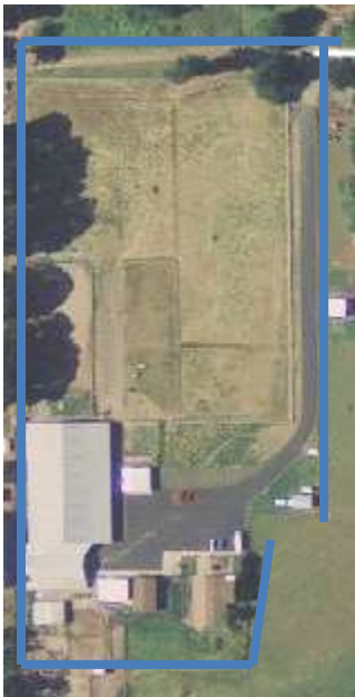
Horse Center – 2258 SW 53rd