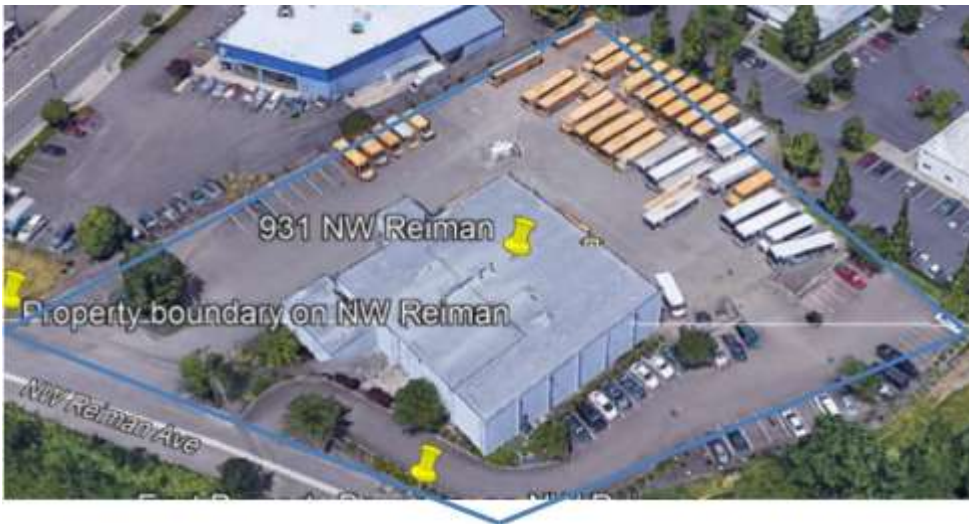
Benton Center North – 931 NW Reiman